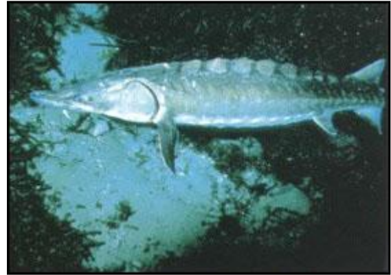
U. S. Fish & Wildlife Service